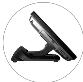
Low Profile Mode