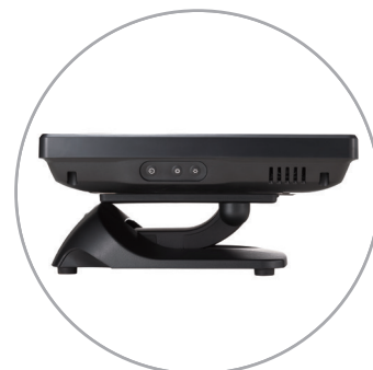
Flat Folded Mode