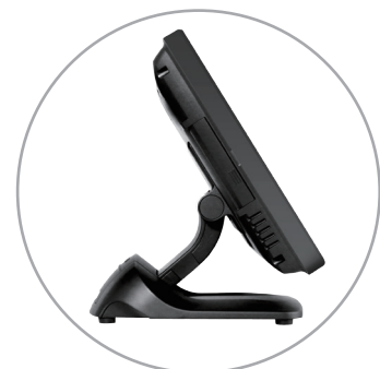
Full Extended Mode

The XT-8315/ XT-8315E provide the selection of two foldable bases, the curvy slim GEN7E base and the larger but practical GEN8E base. The foldable base can be configured into "Flat Folded Mode" to save the shipping package volume, "Low Profile Mode" to allow greater interaction between the cashier and the customer, and the traditional "Full Extended Mode". All this can be achieved with a simple pull of the hidden lever.